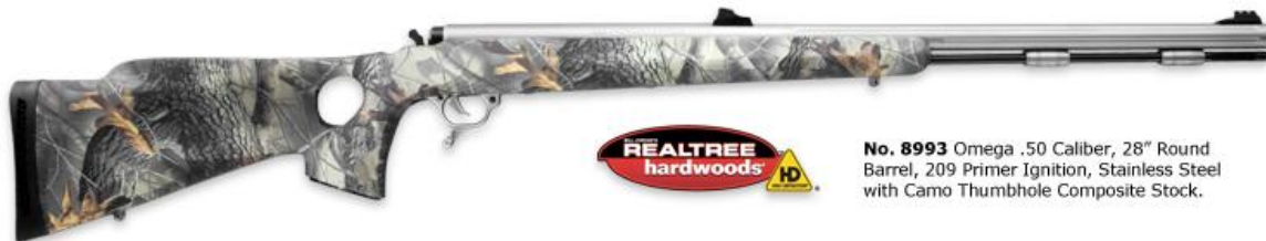
No. 8993 Omega .50 Caliber, 28" Round Barrel, 209 Primer Ignition, Stainless Steel with Camo Thumbhole Composite Stock.